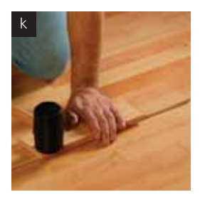
Install the board, using a rubber mallet and a wood block to place it in position.