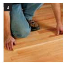
Select a replacement board slightly longer than the one to be changed. Check to see it matches the surrounding boards.

Replacing a damaged or cracked board is a relatively simple operation. If you are not able to perform the repairs yourself, contact your Mercier retailer.