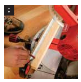
Trim the replacement board to the desired length, cutting excess length from the tongue end.