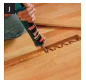
Apply glue to the subfloor.