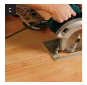
Make a diagonal cut down the center of the board from one end to the other of the cuts made in Step B. It may be necessary to make more than one cut if the board is glued in place.

Using a circular saw or router, cut the board lengthwise to within 1/2" of the edges. For a glued board, make several cuts close together to separate the board into smaller sections.