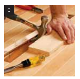
Remove nails or staples (this step does not apply to glued Engineered boards), then remove edges, taking care not to damage the adjacent boards.