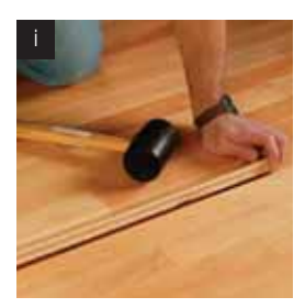
Position the board to check the fit, then remove it.