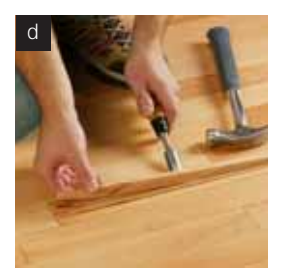
Using a wood chisel, remove the central part of the board first (between the side cuts).